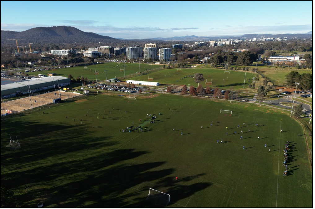
Above image of VEO Southwell Park is courtesy of ACT Government, Riverside Olympic team, below, is courtesy of The Examiner.